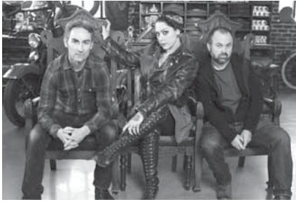
Mike Wolfe, Danielle Colby Cushman and Frank Fritz of American Pickers

Have any items, a collection or junk you want to sell? Don't quite know what's in your barn or storage shed? Frank and Mike want to hear from you.