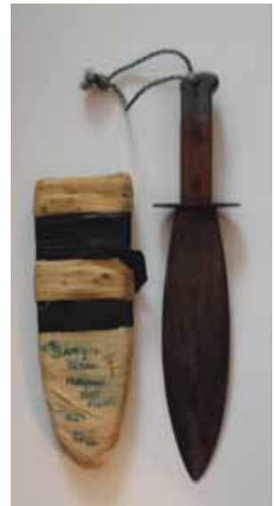
WWII Military Smatchet made by W.R. Case and Sons Cutlery.