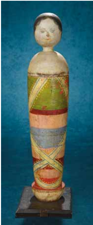
The pink, red, and green stripes probably represent a blanket wrapped around this wooden folk art doll. The 20-inch-doll sold for $1,600 at a doll auction in Maryland.