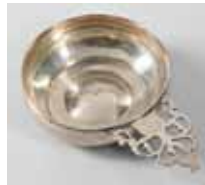
Paul Revere, Jr. made this silver porringer with a cut-out handle about 1770. It sold at auction in Massachusetts for $39,975.