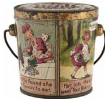
Little Red Riding Hood is outsmarting the Big Bad Wolf by giving him some candy from a pail and rescue Grandma. Not the original story but a great way to sell candy. The Lovell & Covell lithographed tin pail sold for $115 in 2015.