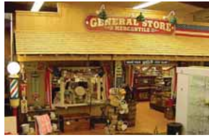
Old Time General Store, full of vintage merchandise for sale, from Barber Shop, Ice Cream Parlor, Hardware Store, Drug Store Memorabilia and much more.

mall, is an Old Time General Store, which will take you back in time to the Mom & Pop stores of years ago. Also, they offer convenient parking for over 100 vehicles, with a spacious area for campers, trailers, and tour buses. You will find it a pleasure to shop in this clean, climate-controlled, brightly lit and carpeted mall. Absolutely one of The Best shopping experiences in Lancaster County!