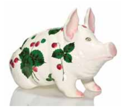
This Wemyss Ware pig was decorated by Joseph Nekola for Jan Plichta. The pre-1952 pig sold for $472.

In the 1930s, Bovey Pottery of Devon, England, bought the rights to make Wemyss Ware and hired Joseph Nekola, Karelson. The pottery by Fife and Bovey is so similar, experts judge the maker by slight color differences. Joseph died in 1952, and very little Wemyss was made in the 1960s and 1970s. But in 1985, Griselda Hill pottery started making it, and they now own the Wemyss Ware trademark. A ceramic