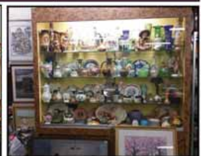
Visit our website for more information www.renningers.net