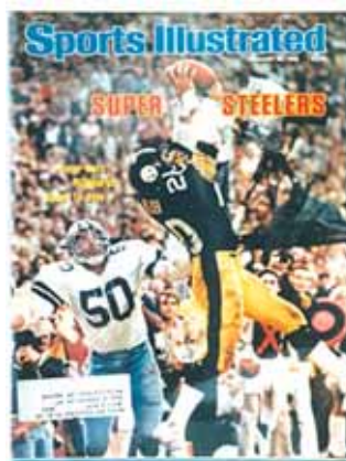
Pittsburgh Steelers on cover of Sports Illustrated, 1979 Super Bowl issue.

College football was so popular in the 1890s that several companies produced board games in the name of the pastime. The George Childs Company offered The Game of Football, complete with wooden bench, team cards, and spinner. The McLoughlin Brothers Company, meanwhile, sold the Yale-Princeton Football