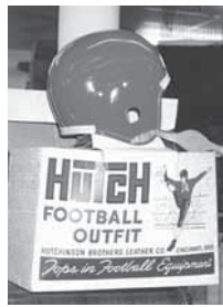
Child's football outfit, Hutchinson Brothers, 1953.

There is a whole field of souvenirs associated with the professional teams, and some of it can be of major interest to collectors. From a 1967 nodder depicting a Green Bay Packer to Celluloid football dolls, originally attached to a stick, sold before games and