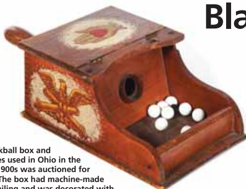
A blackball box and marbles used in Ohio in the early 1900s was auctioned for $500. The box had machine-made dovetailing and was decorated with decoupage prints in painted frames.