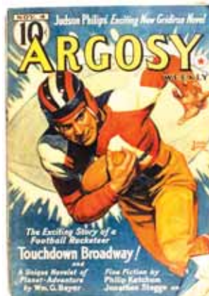
Dime novel, Argosy Weekly, with cover story of Touchdown Broadway, November 1939.

Unlike some collectibles, "The age of an item has less effect on value than its history," notes William Ketchum the author of Sports Collectibles for Fun and Profit. "A 19th century helmet of unknown origin is not nearly as valuable as a