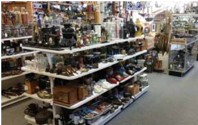
A sampling of merchandise, such as Old Tools, Firefighting, Oil and Automobile Memorabilia.