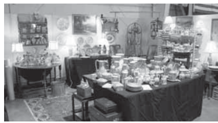
ed in the shows. What makes this "family" is that several

Well, first things first – if you've never attended this amazing, long-running show, you have truly missed one of the most exciting and diverse antique and collectibles shopping experiences in the mid-Atlantic area, even the entire eastern seaboard. What makes the show so special are the people. Over the period of 64 events, there have been thousands of dealers that have participat-